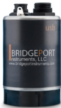
usbBase: eMorpho MCA + HV with USB & GPIO.

The usbBase is a PMT plug-on with a digital MCA, embedded high-voltage generator and divider.